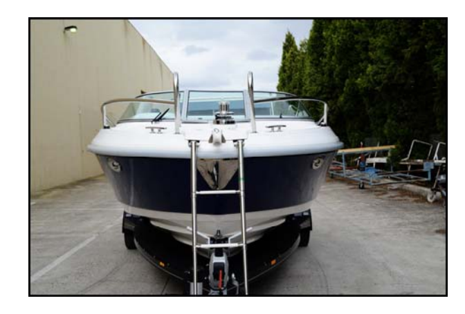
Road Transport Trailer