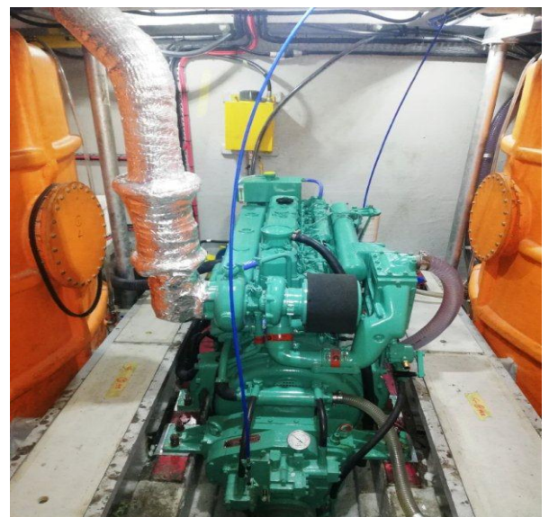
SPACIOUS ENGINE ROOM